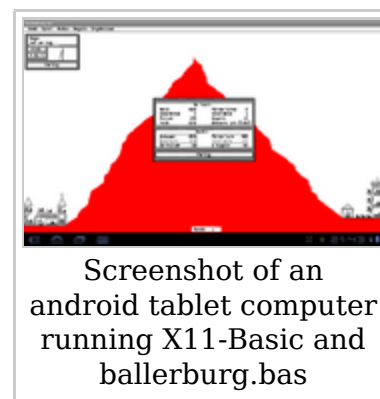
Screenshot of an android tablet computer running X11-Basic and ballerburg.bas